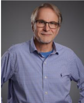
Claims Dispute Resolution OCAA and PSAA Education Chair